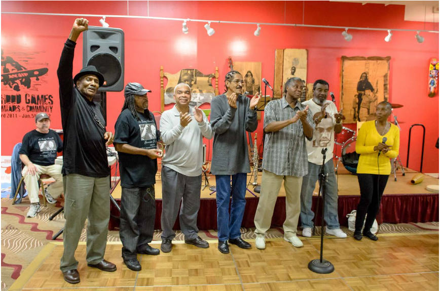
San Francisco 8 victory celebration, November 2011, as six of the eight defendants' charges are dropped

against their own values are capable of change when they receive direct feedback and support? What if we assumed there was truth in the feedback we receive, and made active efforts to repair and rebuild? What if we all worked hard every day, as Alicia Garza, a co-founder of Black Lives Matter put it, to be “high impact, low ego?”