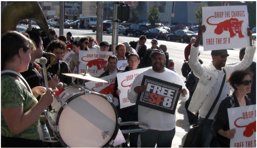
Community rallies to demand the freedom of the San Francisco 8, 2011.